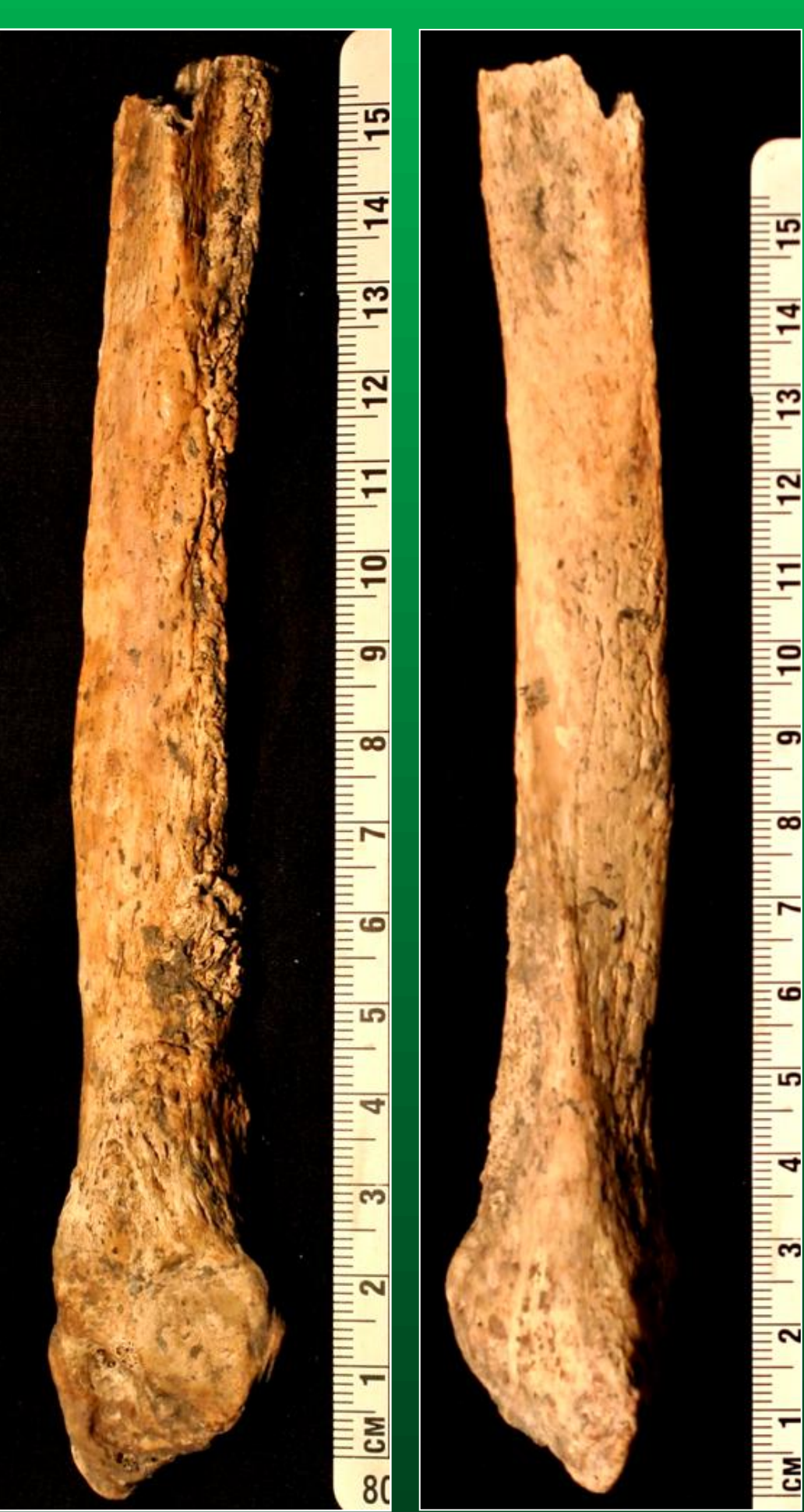
FIG. 1. Case 1, left fibula with inflammatory/periosteal reactions, medial view (left) and

-In addition, one unsided proximal pedal phalanx shows early signs of resorption of the base and in another proximal pedal phalanx, atrophy of the shaft.