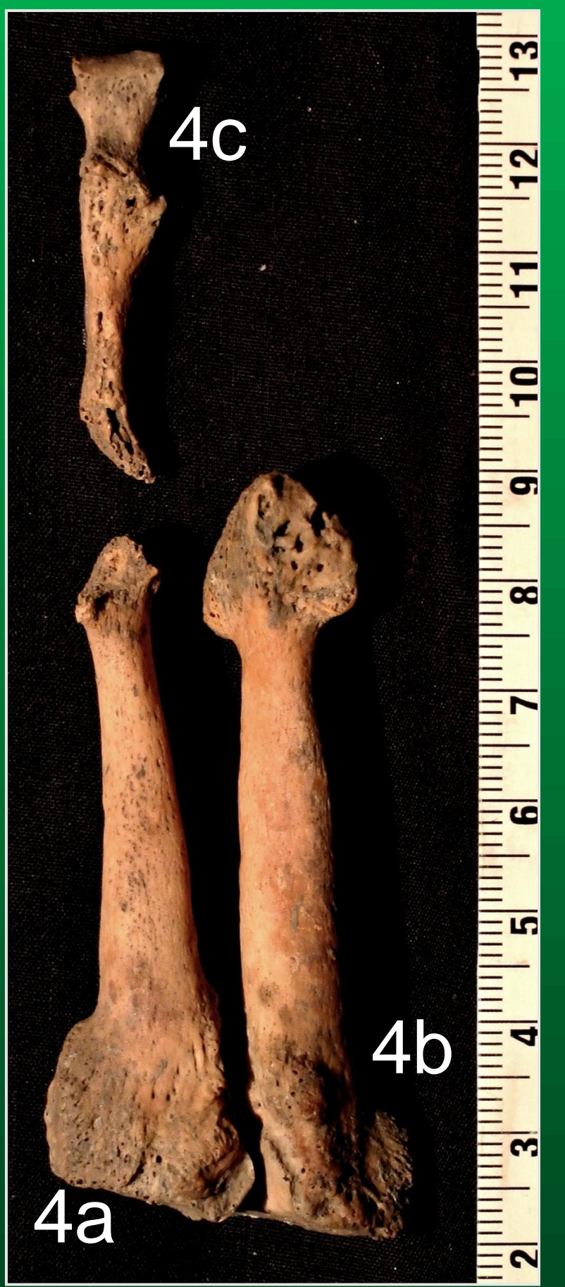
FIG. 4. Case 1, right (a) 2<sup>nd</sup> and (b) 3<sup>rd</sup> metatarsals (dorsal view) with resportion of the heads and (c) ankylosis of proximal and intermediate phalanges. Scale is in cm.

and the alveolar process of the maxilla in leprosy. Int. J. Leprosy. 20, 5.