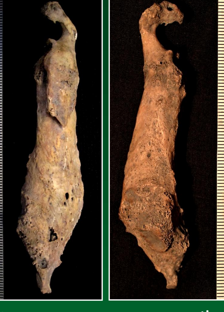
FIG. 5. Case 2, fused possible right 5<sup>th</sup> metatarsal and proximal pedal phalanx, (left) dorsal view, (middle) lateral view, and (right) medial view) exhibiting possible manifestations of leprosy. Scales are in cm.