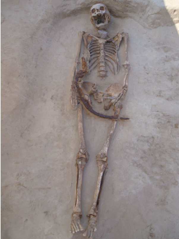
Figure 2. (Colour online) Vampire burial 60/2010 (45–49 year old female). Note the placement of the stone beneath the chin and the sickle across the abdomen.

do not appear to be segregated in any fashion in terms of geographic placement.