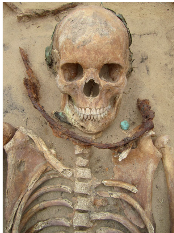
Figure 1. (Colour online) Vampire burial 6/2012 (16–19 year old female). Note the placement of the sickle around the neck and the coin to the right of the cranium.

Of the more than 330 human burials recovered from the Drawsko cemetery to date, six of them have been classified as deviant burials based on their context and mortuary treatment (see Table 1; Figs. 1 and 2). These burials all have indications of anti-vampiristic alterations, suggesting that each of the six were at particular risk of becoming a vampire. In five of the deviant burials, a sickle or scythe is included. Two of the individuals have large stones placed beneath their chins, which likely serves as a method to prevent the corpse from being able to open its mouth and chew through burial cloths and/or to break its teeth on them (Barber 1988). There is no indication of secondary disturbances of these graves; these individuals were not disinterred after suspected vampiristic activity. Instead, their unusual burial context was done at the time of interment, indicating that these treatments were aimed at preventing vampirism rather than stopping it once a vampire was believed to be active. The individu-